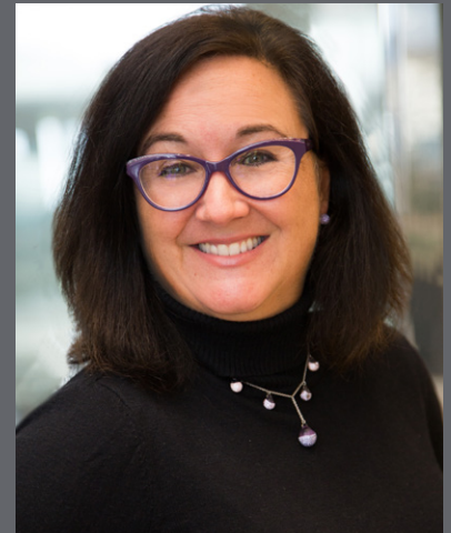
ATTORNEY AT LAW